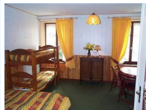
Sleeps - bed(s)