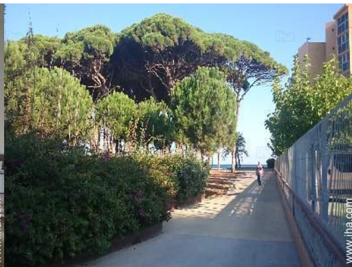
view over a pedestrianized street