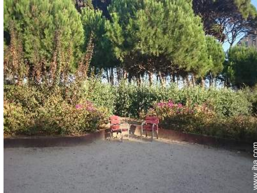
park and garden