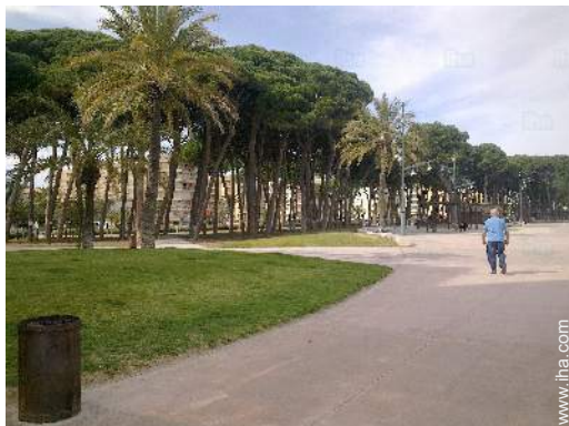
view over a pedestrianized street