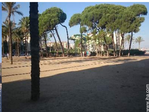
leisure pursuits nearby