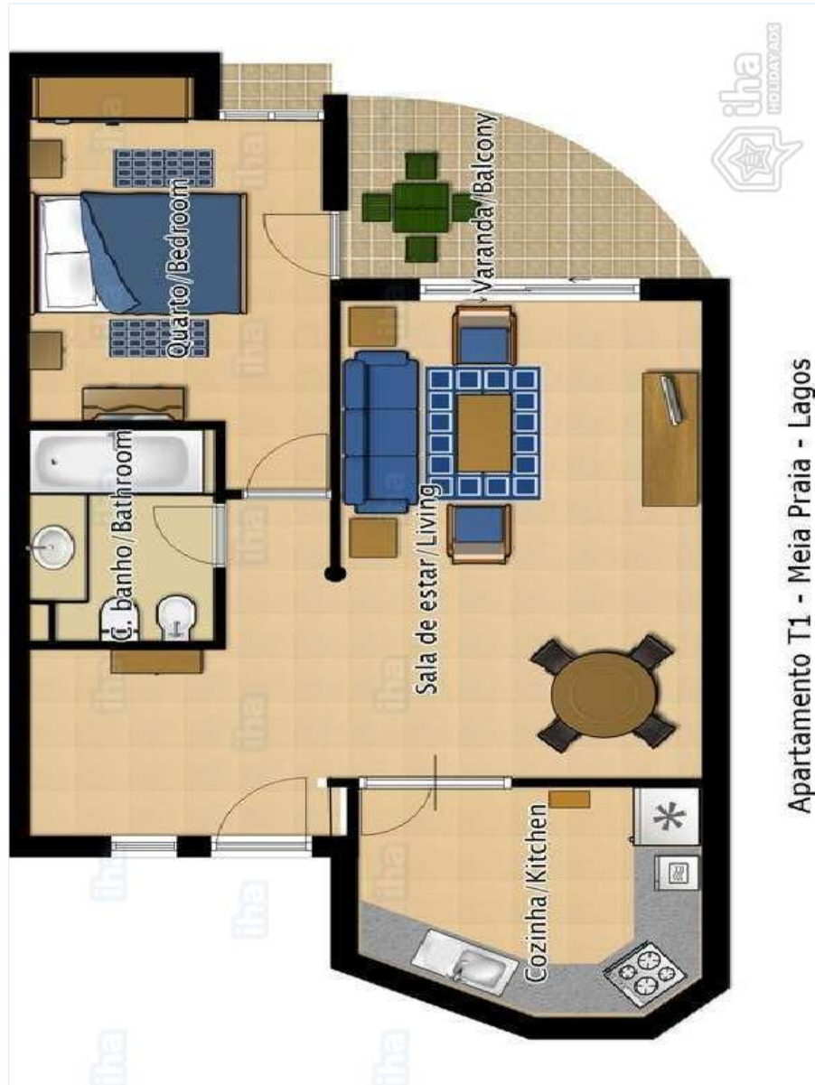
Apartamento T1 - Meia Praia - Lagos