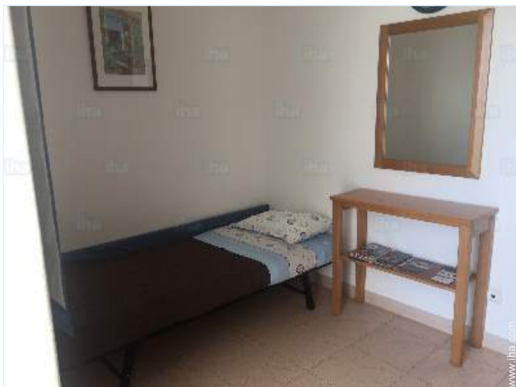
twin storage bed 1 pers