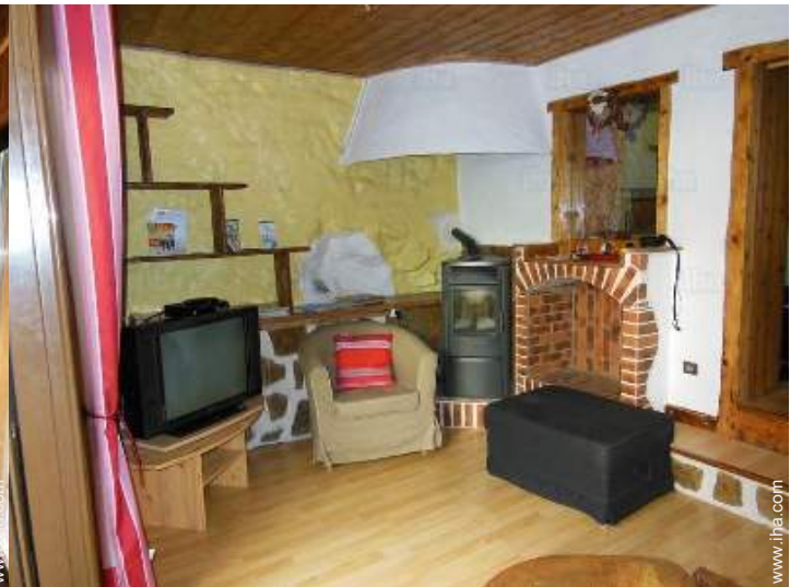
view from the living room