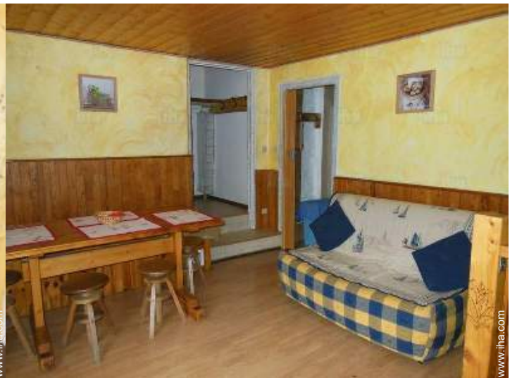
view from the balcony