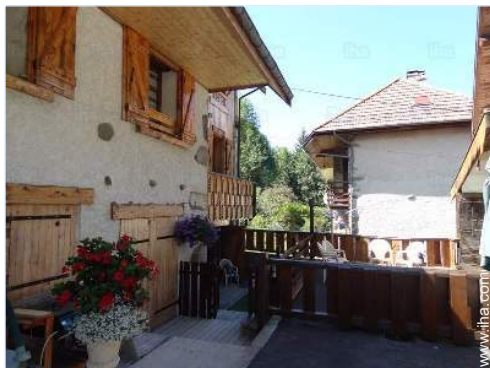
general floor plan