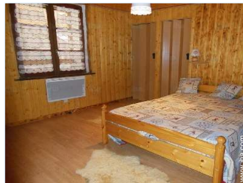
view from the apartment