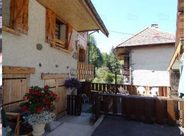
general floor plan