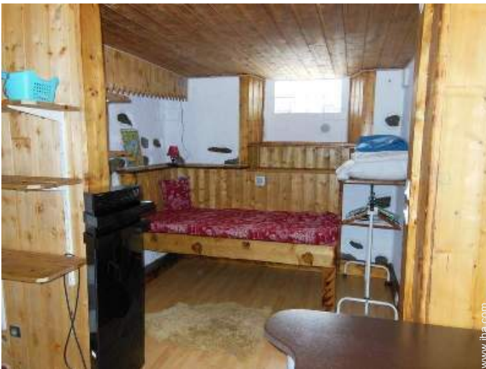
view from the living room