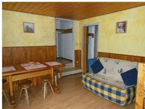
view from the balcony