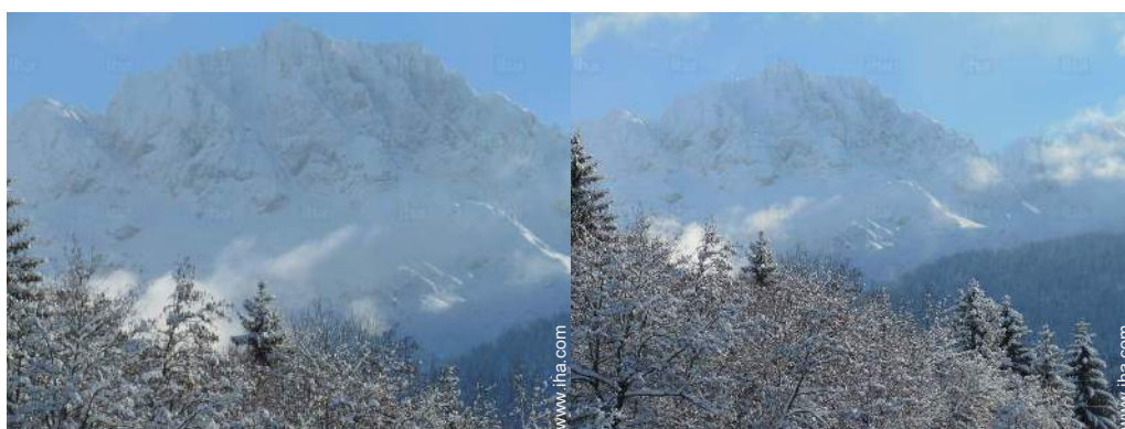
view from the house