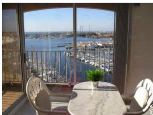
view of the port

Covered parking : 1 closed individual place (s).