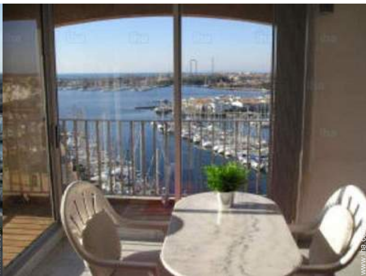
view of the port