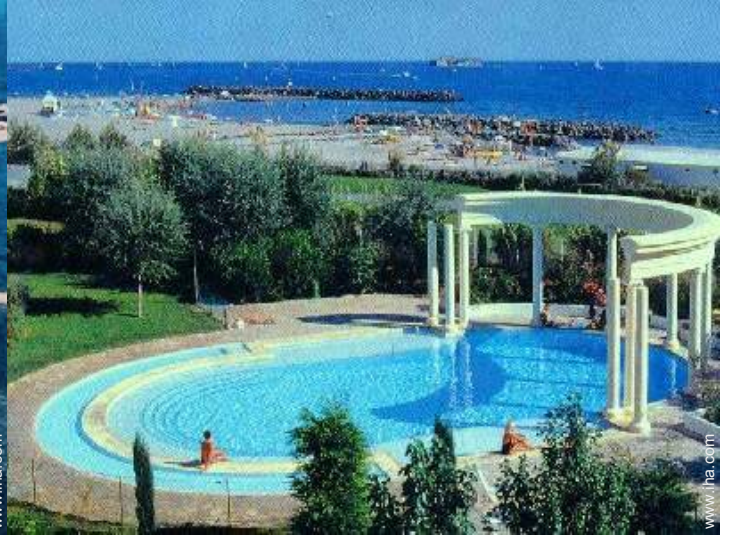
Oval swimming pool