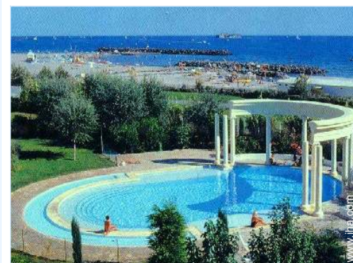
Oval swimming pool