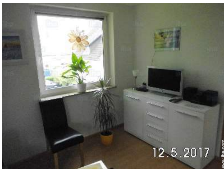
view from the living room