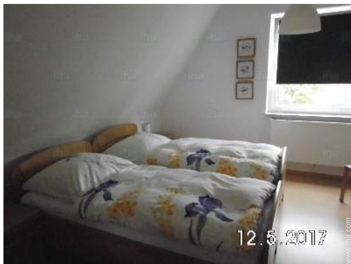
view from the bedroom