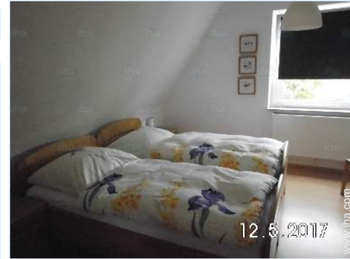
view from the bedroom