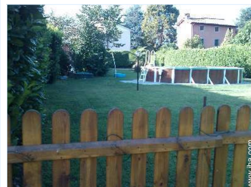
Oval swimming pool