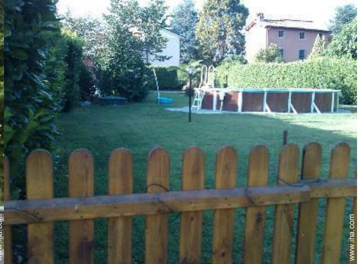
Oval swimming pool