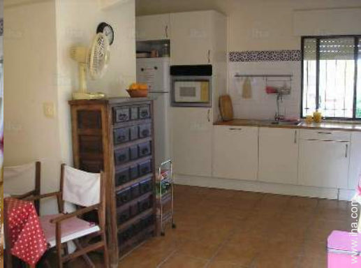
large separate kitchen