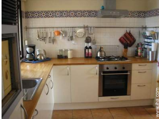
large separate kitchen