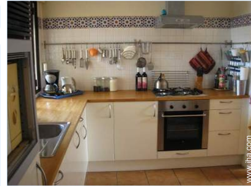
large separate kitchen