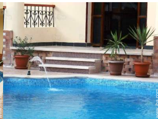
private swimming pool