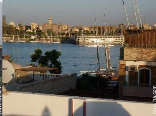
view from the roof terrace