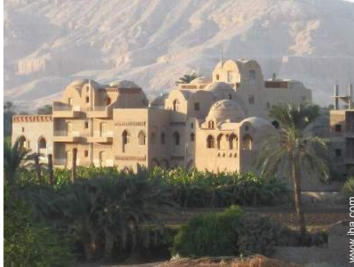
view from the roof terrace