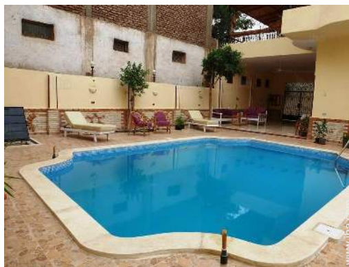
private swimming pool