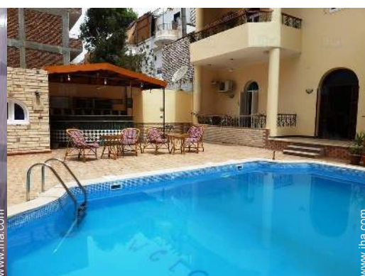
private swimming pool