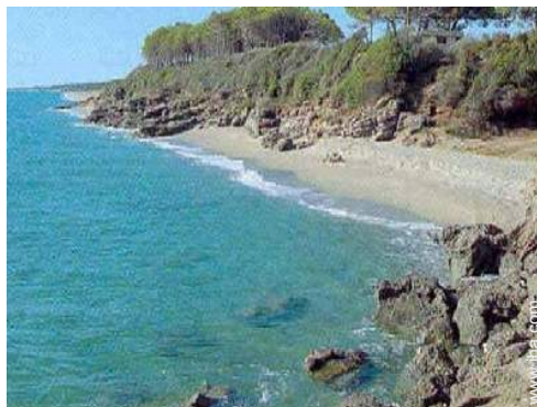
summer sports nearby