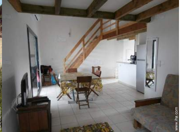
sleepers sofa(s) 2 pers