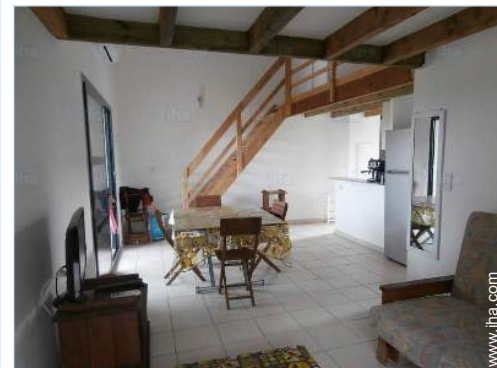
sleeper sofa(s) 2 pers