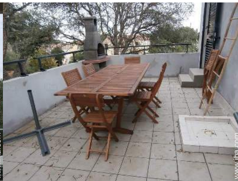
outside shower facilities