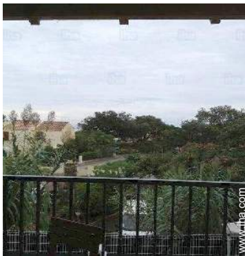
view from the covered terrace