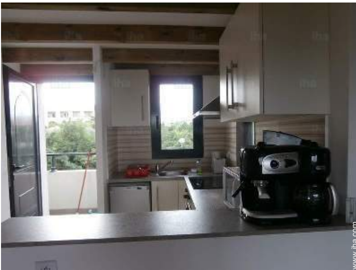
electric espresso coffee maker