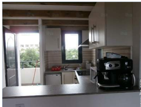
electric espresso coffee maker