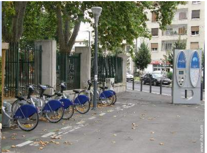
bike/mountain bike hire