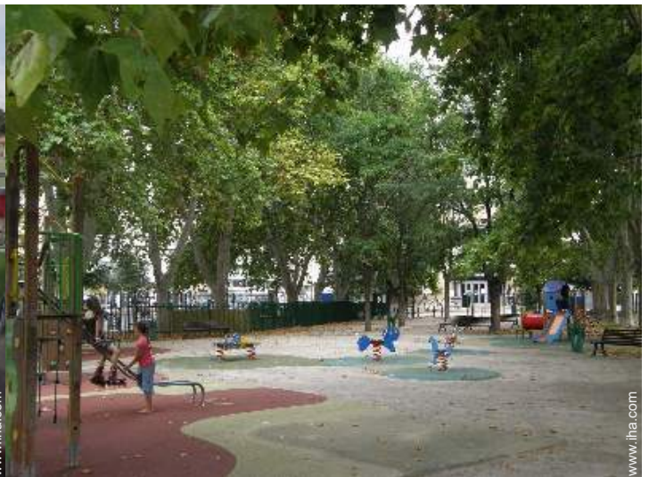
park and garden