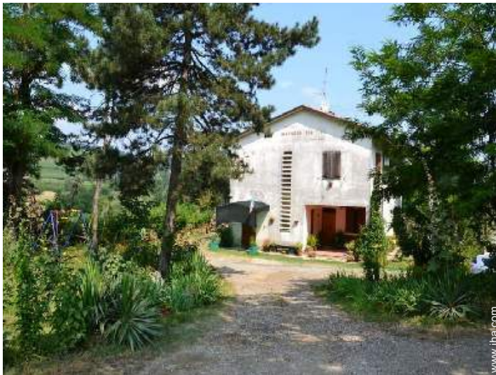
View from the property