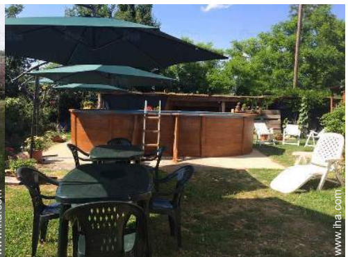
view from the swimming pool