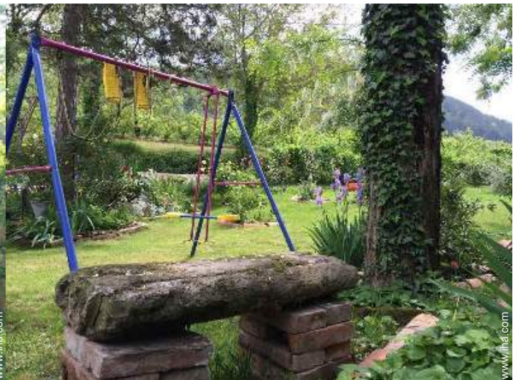
view from the garden/park