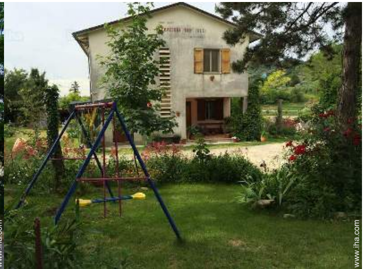
View from the property