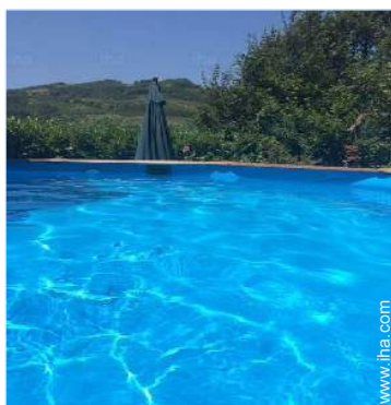
view from the swimming pool