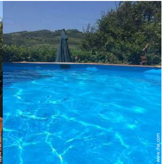
view from the swimming pool