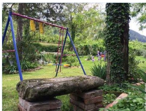
view from the garden/park