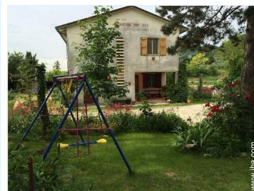
View from the property

Downtown 2.5mi. Bus stop / bus station 0.62mi. Breadstore 2.5mi. Local stores 2.5mi. Supermarket 2.5mi. Hairdressing salon 2.5mi. Mail office 2.5mi. Bank 2.5mi. Drugstore 2.5mi. Doctor 2.5mi. Dispensary 2.5mi.