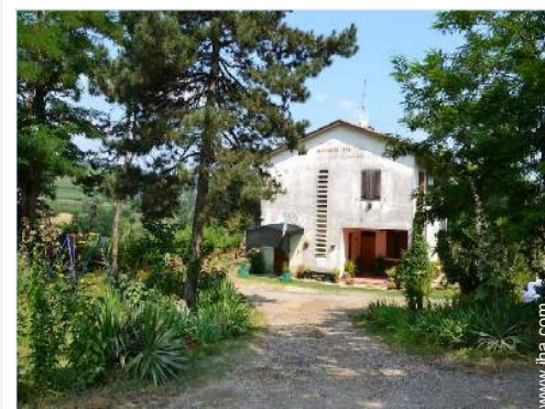
View from the property