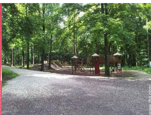
view over the forest