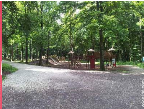
view over the forest