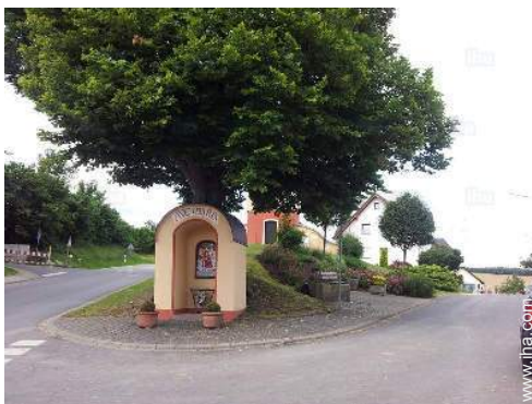
view of the village