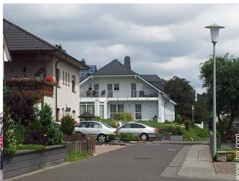
the apartment house/building