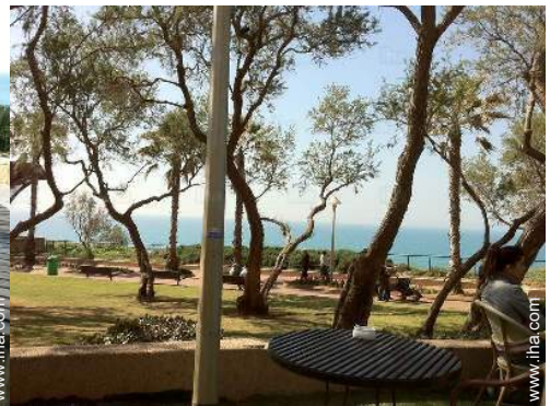
park and garden