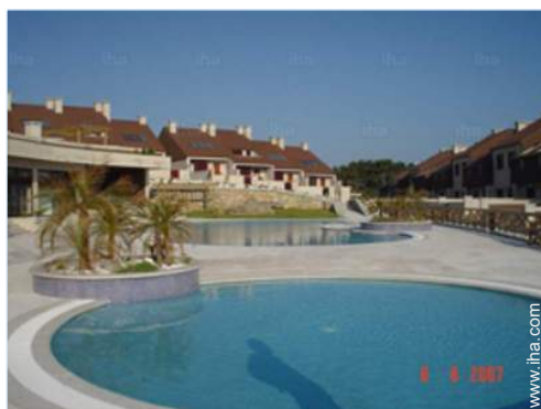
public swimming pool