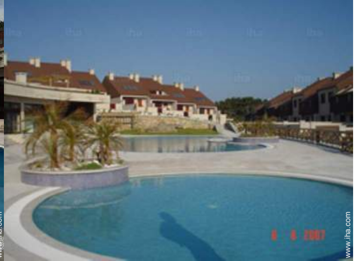
public swimming pool