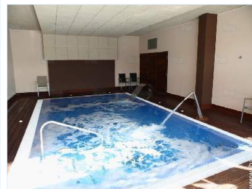
heated swimming pool