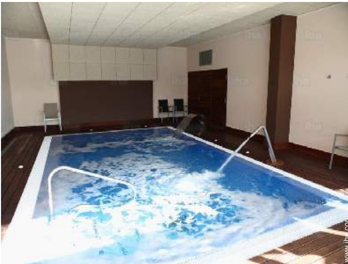
heated swimming pool