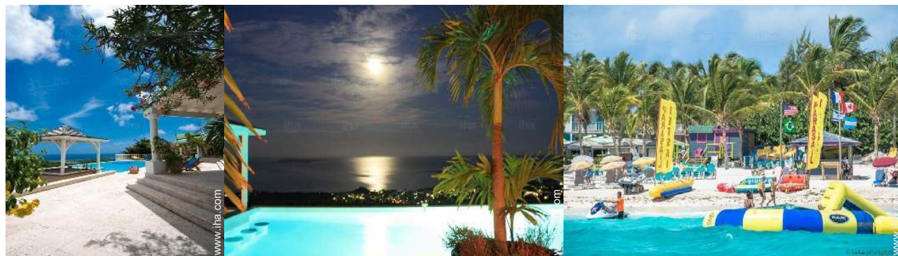
view from the terrace