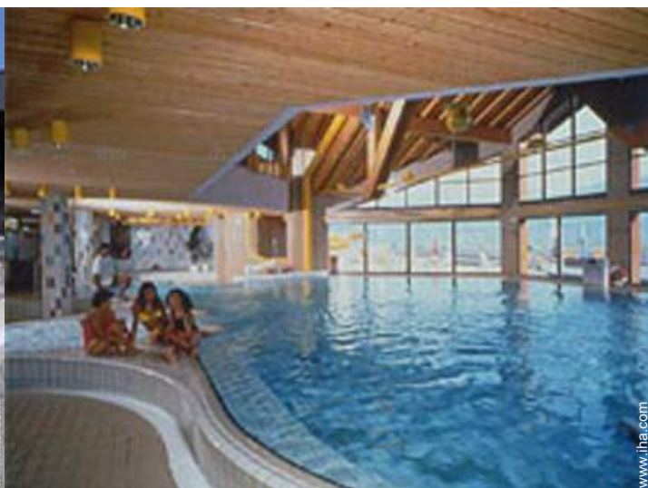
Covered swimming pool