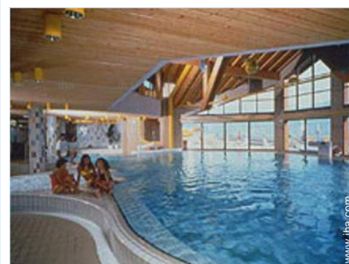
Covered swimming pool

Ski slopes 330' Ski lifts 330' Heated swimming pool <165' Public swimming pool <165' Forest 0.3mi. Mountain range 0.3mi.