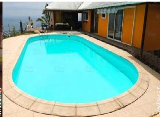
Oval swimming pool