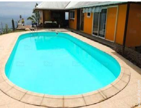
Oval swimming pool