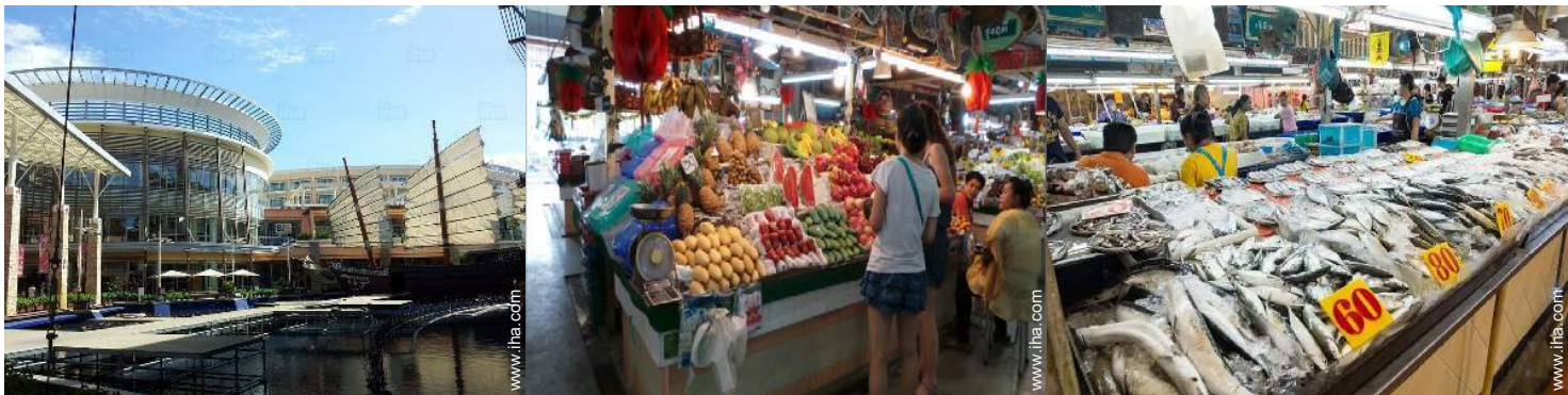
high class retailers