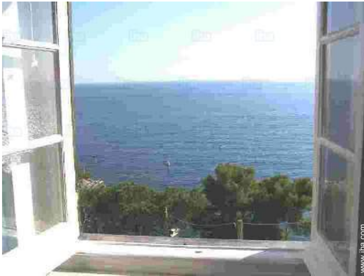
view from the apartment