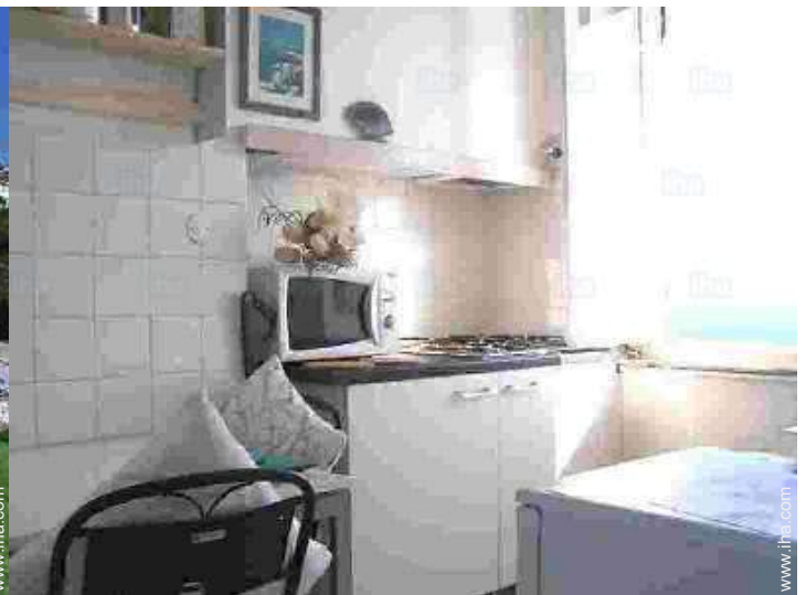
view from the kitchen