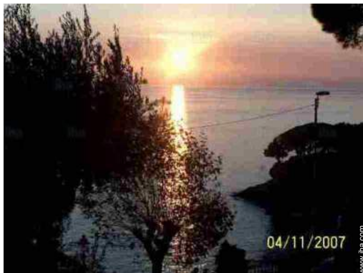
view of the sunset