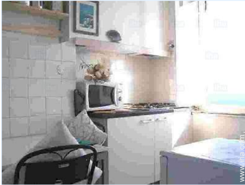
view from the kitchen