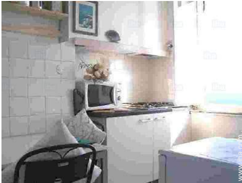
view from the kitchen