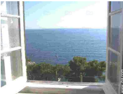
view from the apartment