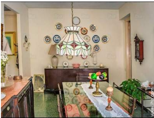
view from the dining-room