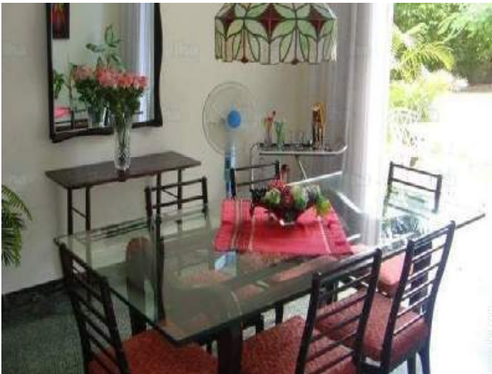
view from the dining-room