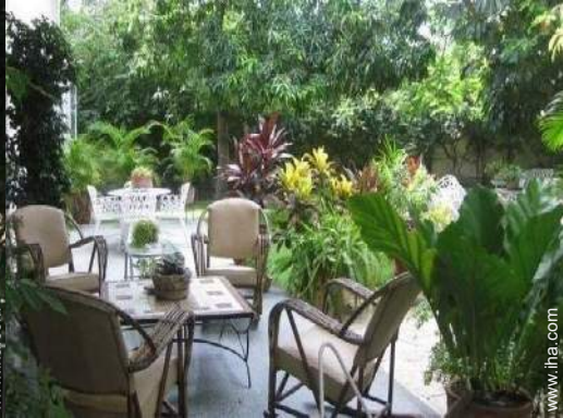
view from the veranda