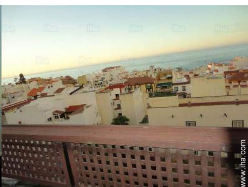
view from the apartment