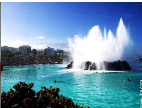
seaside pursuits nearby