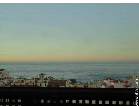
view from the terrace