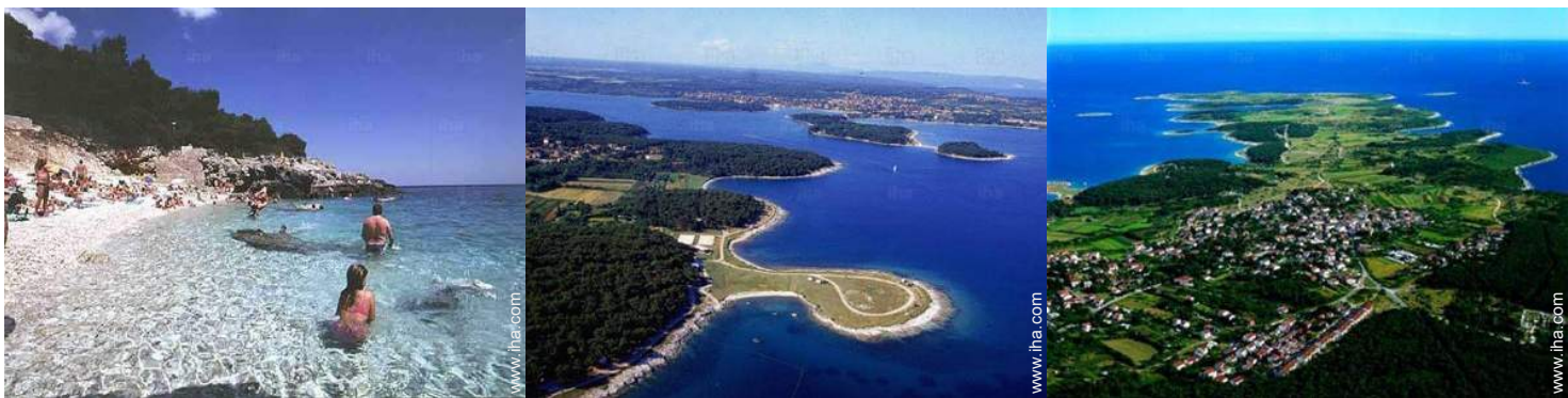
leisure pursuits nearby