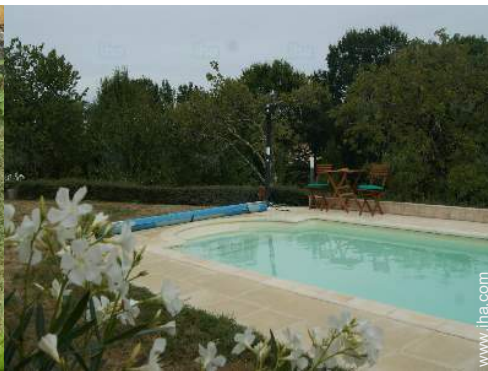
Heated swimming pool