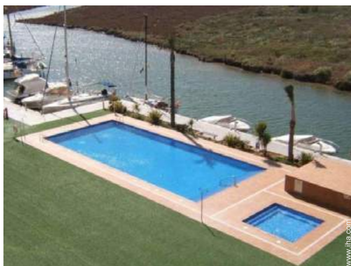
Exterior facilities at guests disposal