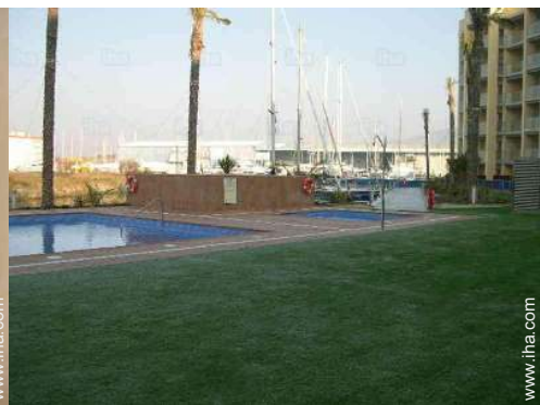
view of the port