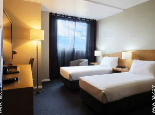
possible extra bed(s)