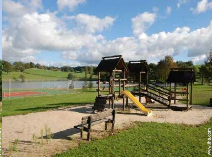
seaside pursuits nearby