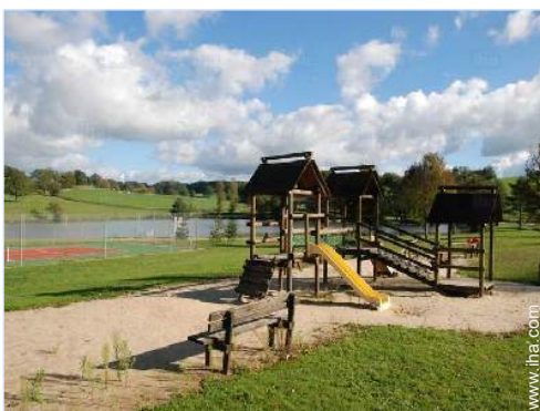
seaside pursuits nearby