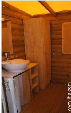
Guest facilities and furnishings