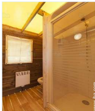
Interior layout and facilities