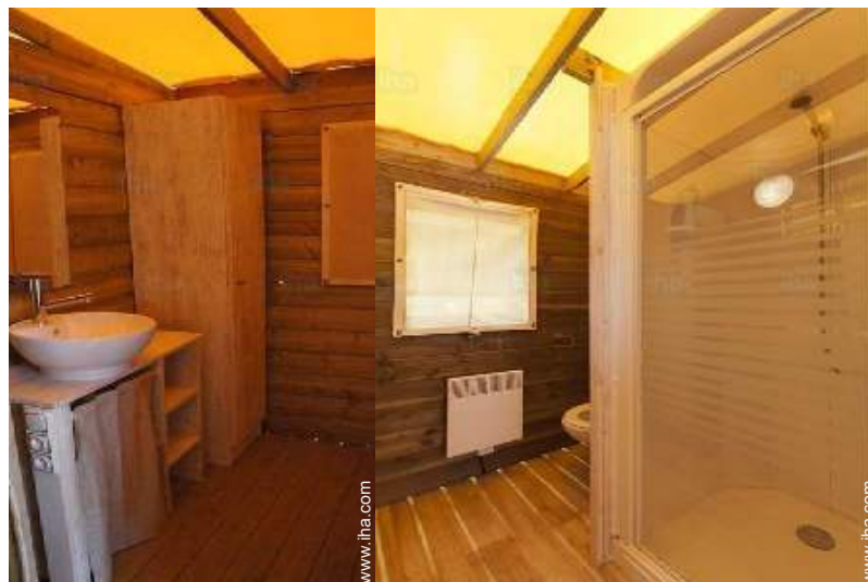
Guest facilities and furnishings