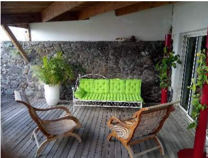
Equipment at the guest's disposal