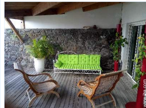
Equipment at the guest's disposal