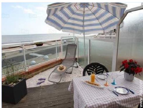
view from the terrace