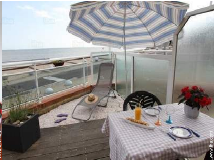
view from the terrace