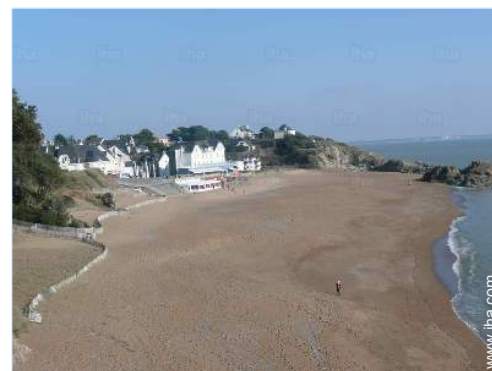
view over the sea