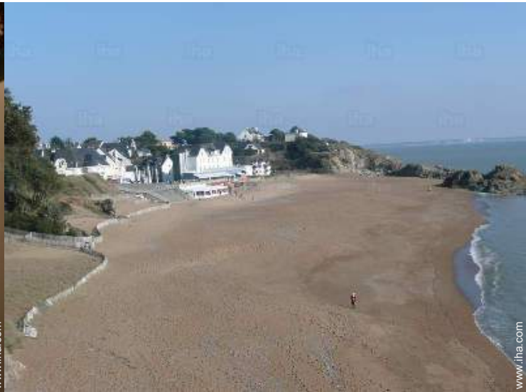
view over the sea