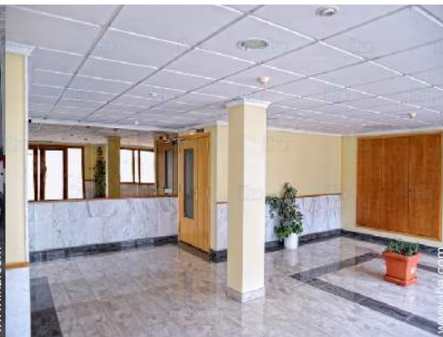
the apartment house/building