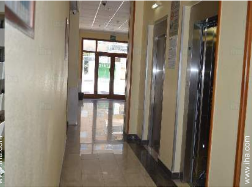
the apartment house/building