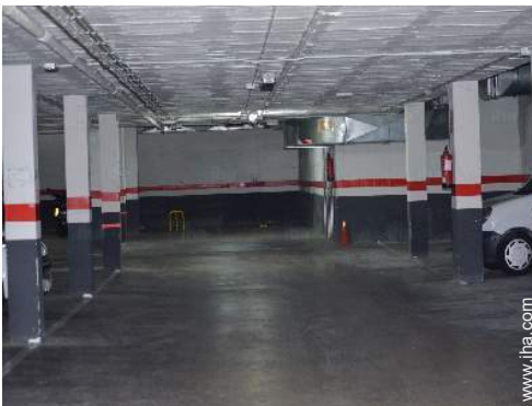
the apartment house/building