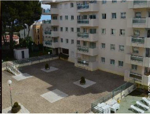
the apartment house/building