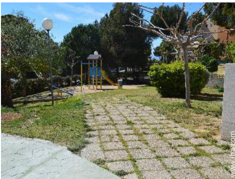
the apartment house/building