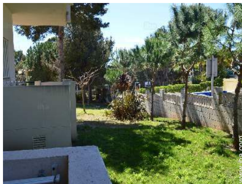
the apartment house/building