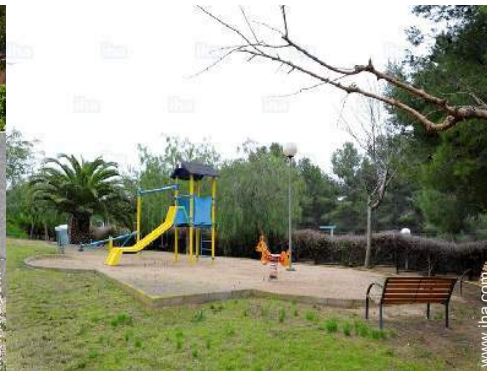
the apartment house/building