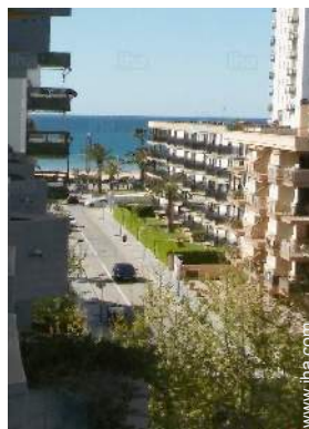
view from the covered terrace