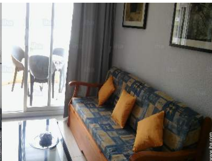
sleepers sofa(s) 2 pers