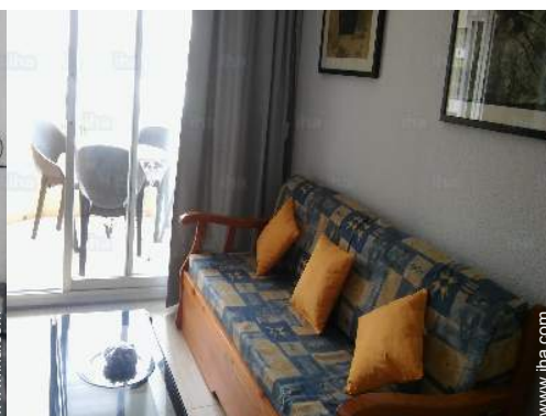
sleeper sofa(s) 2 pers