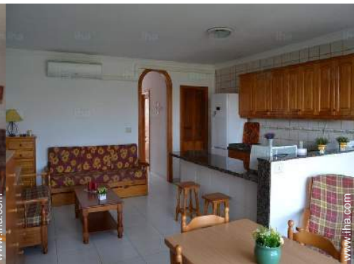
sleeper sofa(s) 2 pers