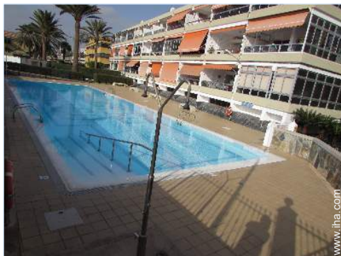
private swimming pool

Private swimming pool, rectangular (length 100', width 33'), illuminated, step ladder, outside shower (open from 'january 01' till 'december 31')