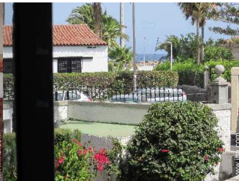
view from the living room