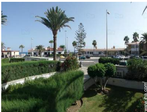
view from the living room