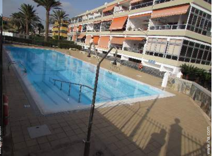
private swimming pool