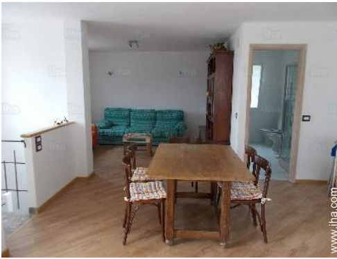
twin storage bed 1 pers