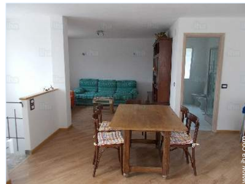
twin storage bed 1 pers