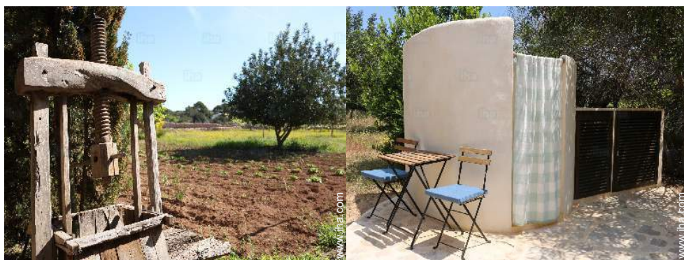
outside shower facilities