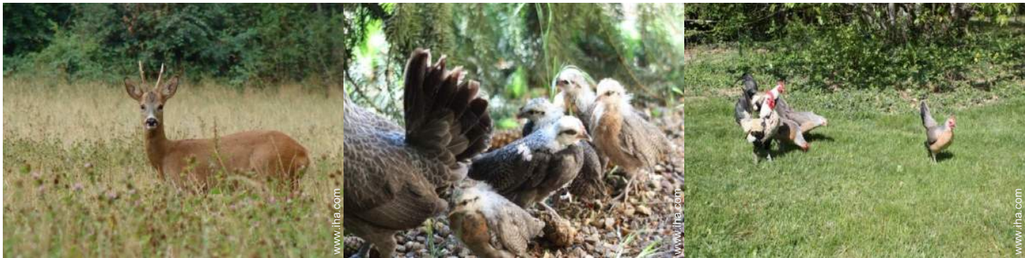
view over the countryside