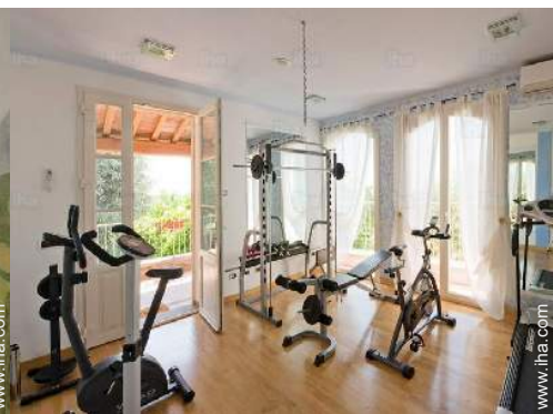
Equipment at the guest's disposal