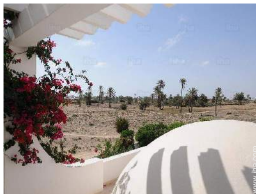
view from the house