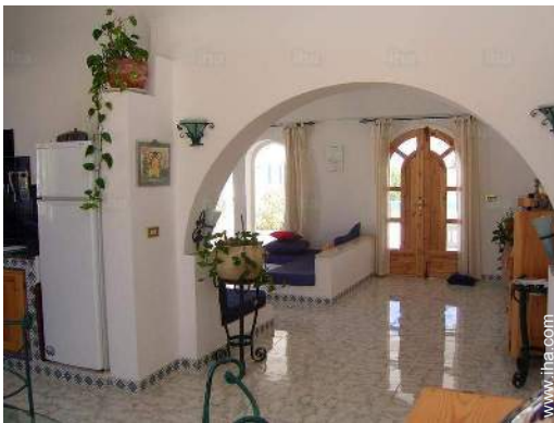
view from the living room