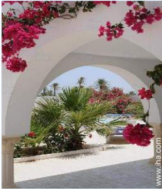
view from the veranda