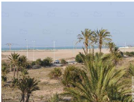
view from the roof terrace