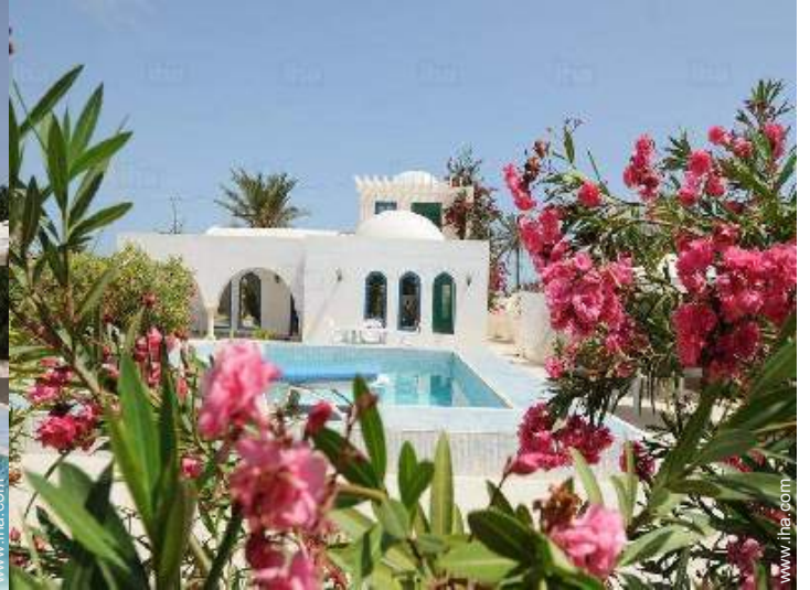
view from the garden/park