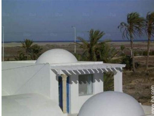
view from the roof terrace