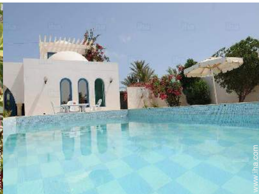
view from the swimming pool