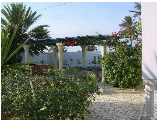
view from the covered terrace