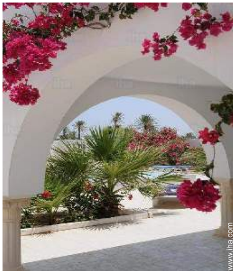
view from the veranda