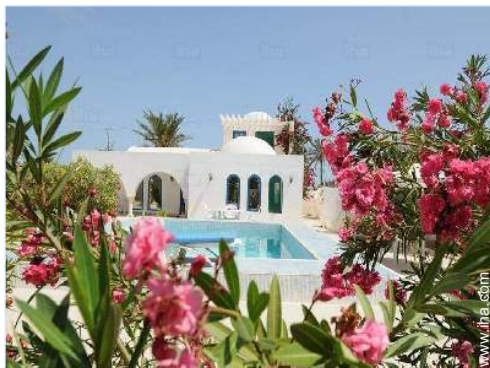
view from the garden/park