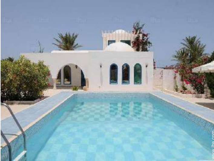
private swimming pool