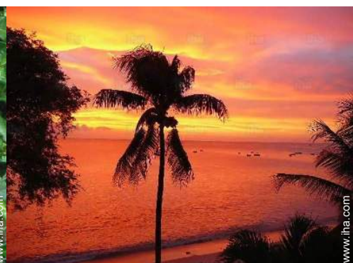
view of the sunset