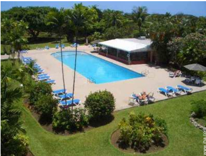
view from the balcony