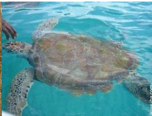
leisure pursuits nearby