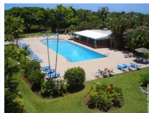
view from the balcony