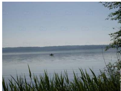
view over the lake