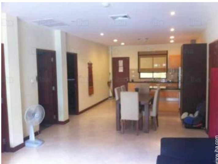
view from the dining-room