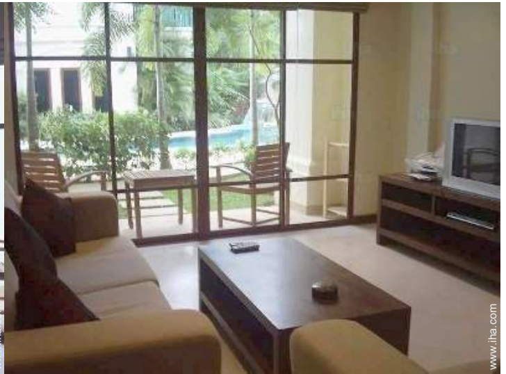
view from the apartment