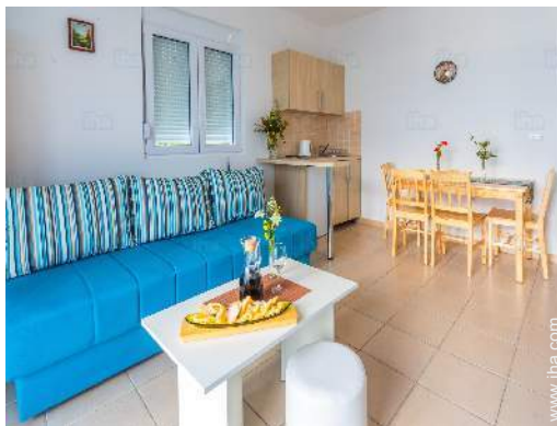
view from the sitting-room