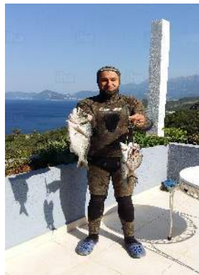
Attractions and relaxation