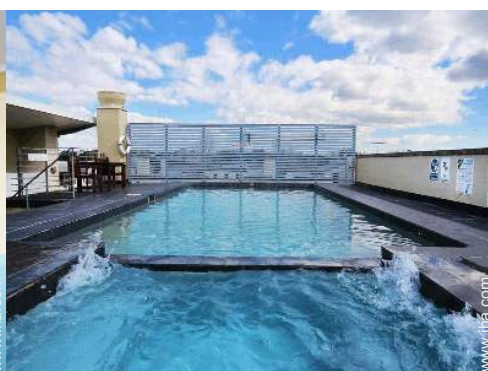
shared swimming pool