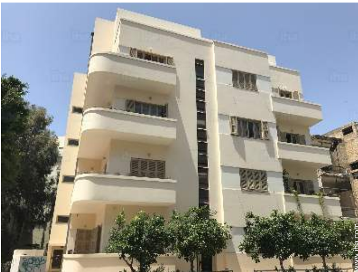
the apartment house/building