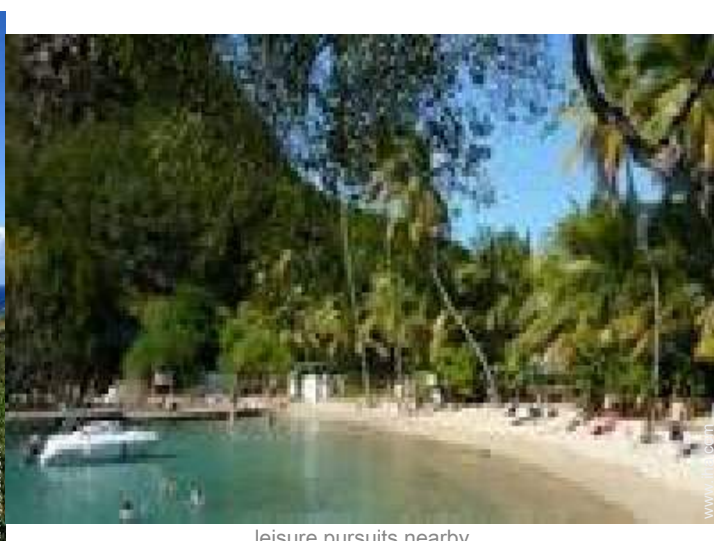
leisure pursuits nearby