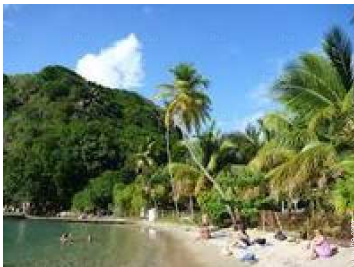
leisure pursuits nearby