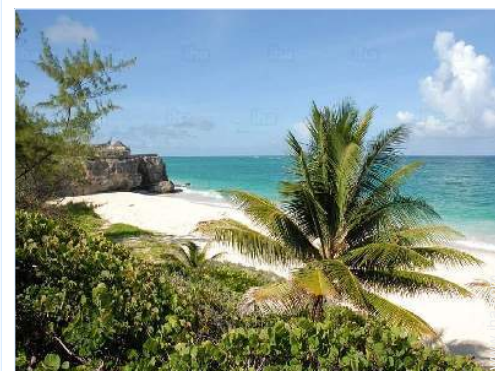
direct access to the beach