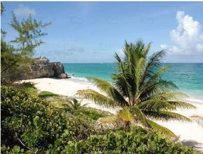
direct access to the beach