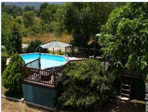
private swimming pool