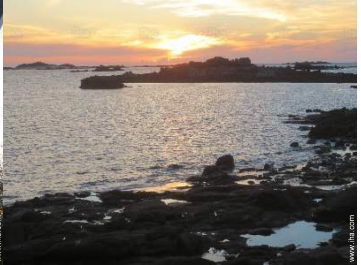
view of the sunset