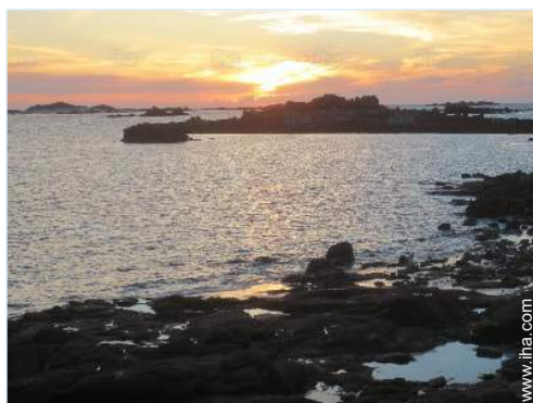
view of the sunset