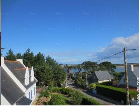
view from the bedroom