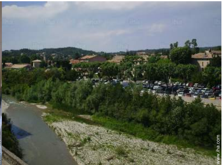
view from the apartment